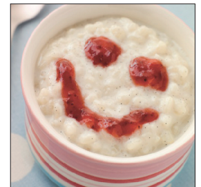
RICE PUDDING DESSERT